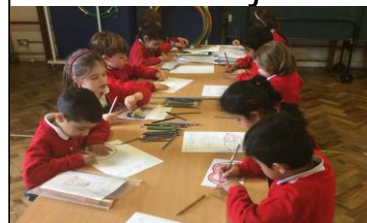
Designing superhero masks