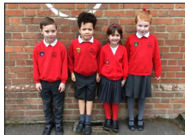
House Captains for this term