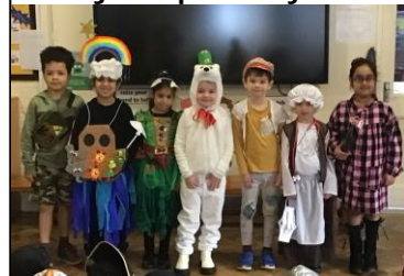
World Book Day 2023