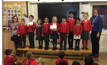
Poetry Competition finalists