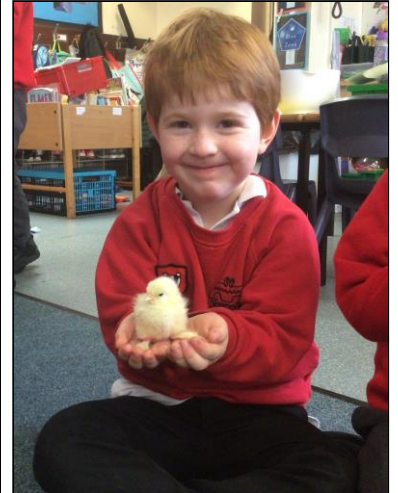
Meeting the chicks!