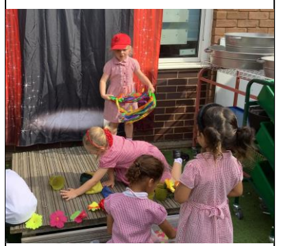
Decorating our stage with flowers!