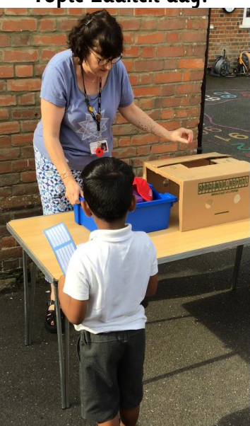
Going through Airport Security!