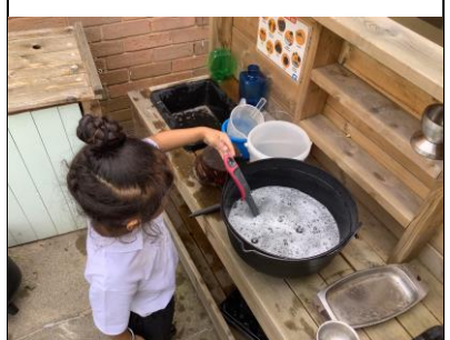
Making potions in the nature kitchen!