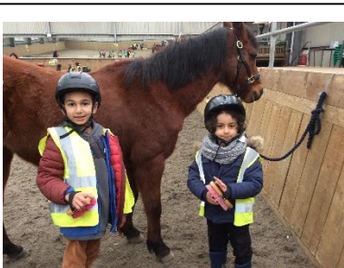
Meeting the ponies

The whole school visited South Bucks RDA on Friday which was kindly organised by Miss Tolmie. The children behaved exceptionally well and were very engaged the whole day. They took part in many fun activities including grooming the ponies, taking part in an obstacle course and interviewing a volunteer at the centre. The children also enjoyed a very muddy walk around the woods before coming back to school!