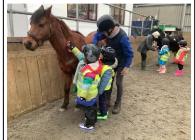
Grooming the ponies