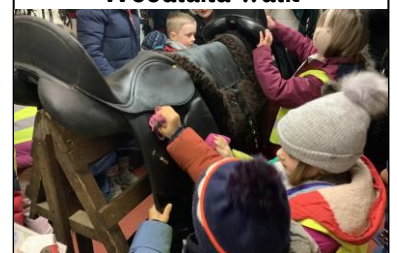
Exploring the tack room