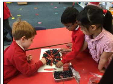
Making the British flag from fruit!