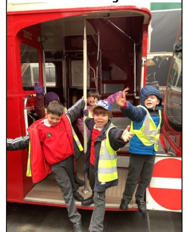
Exploring the London Bus Museum