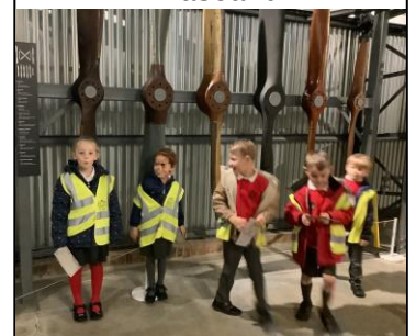
Propellers in the aircraft factory