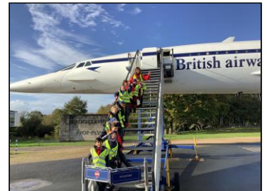
A walk on Concorde!