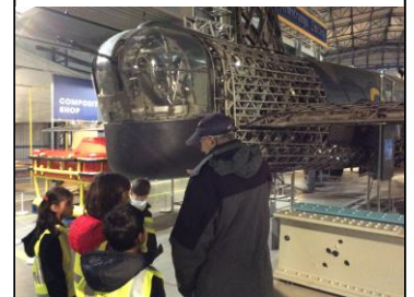
Planes through time