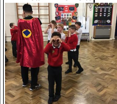
Year 2 Workshop