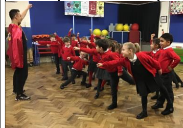
Year 1 Workshop