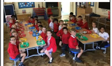
Jacket Potato lunch