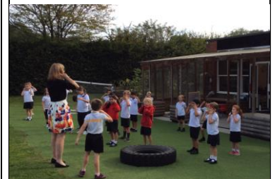
Year 1 Science: Head, Shoulders, Knees & Toes ...