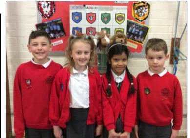
New House Captains