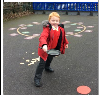
Flip the pancake