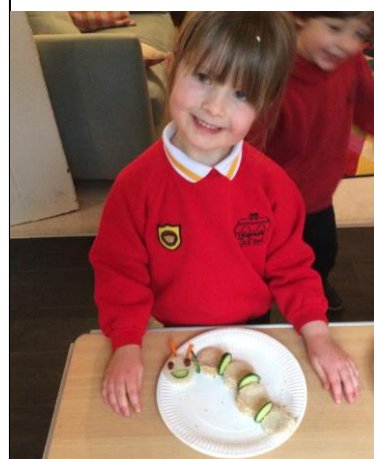
Making a caterpillar sandwich