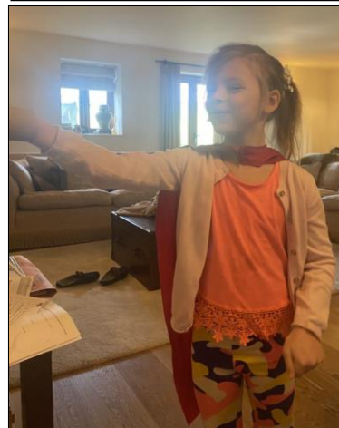
World Book Day