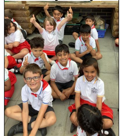
Waiting to dance!