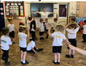
Balancing in PE