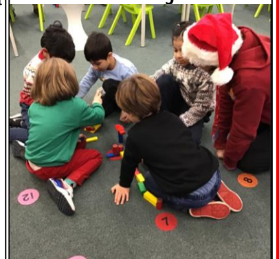
3D shapes in Year 1