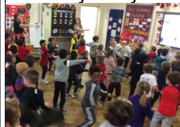
The Big Move