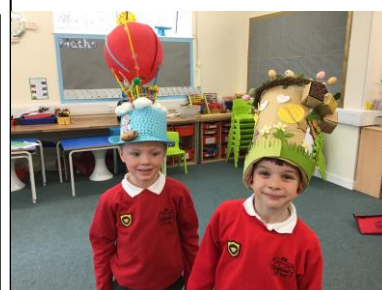
Easter Bonnet parade