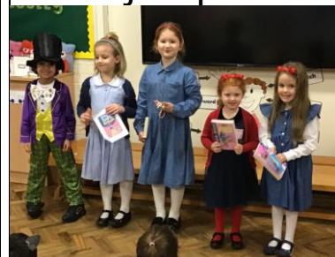
Roald Dahl characters