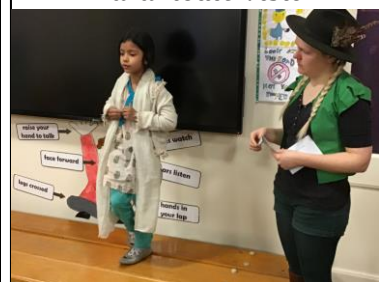
Winner of most original 'Hero' costume: Malala Yousafzai