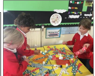
Making Paper Chains