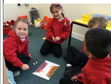
Practising maths skills through games