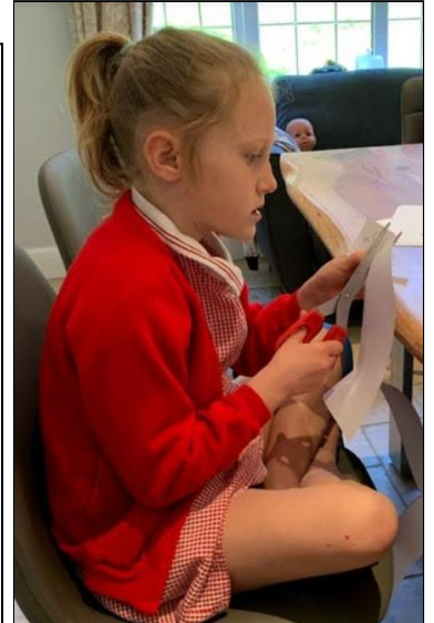
Making a Food Chain