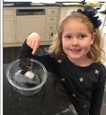
Ice cube experiment