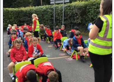
Flight to Madagascar