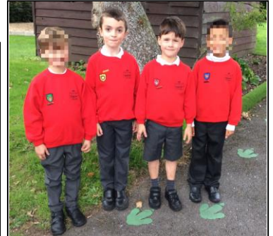
New House Captains