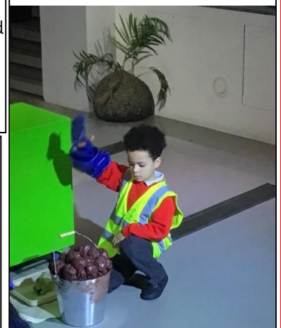
Handling dinosaur pooh