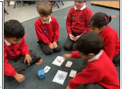
Subitising game in maths