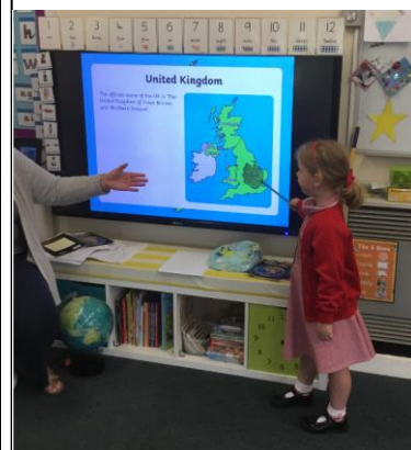
Learning about GB