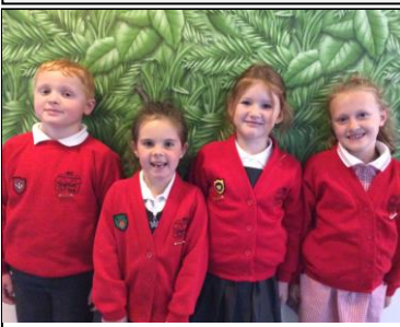
New House Captains