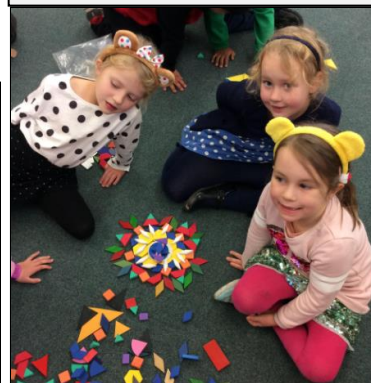
Diwali pattern in Maths