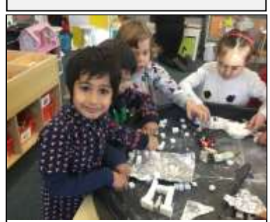
Building an igloo using sugar cubes