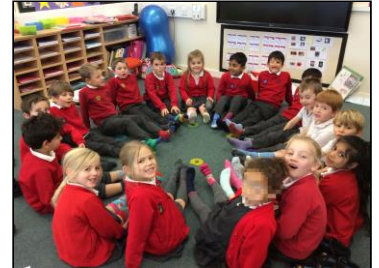
Odd Socks Day