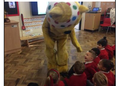
Children in Need