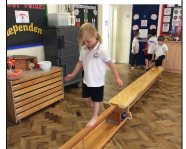
Balancing in PE