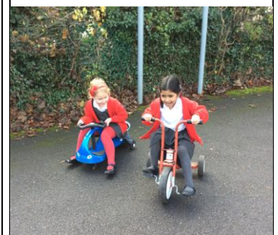
Year 1 Bikes