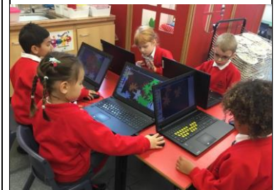
Using the laptops