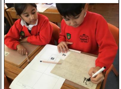
Year 2 Maths