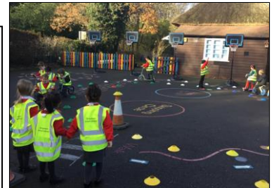
Road Safety Role Play