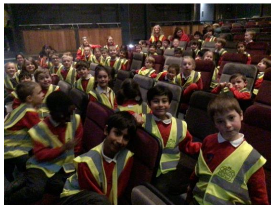
Norden farm trip

This week we look forward to our termly interhouse competition which is always fun and Thursday is Christmas Jumper Day.