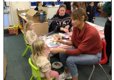
Christmas face painting!