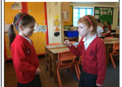
Creating a story freeze frame!