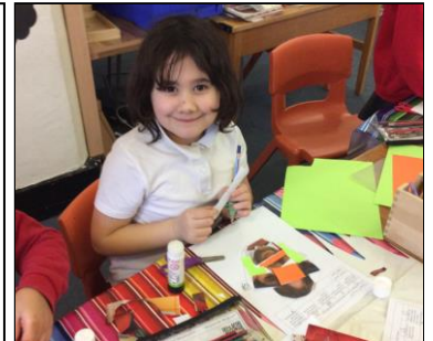
Abstract art in Year 2