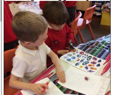
Abstract art in Year 1