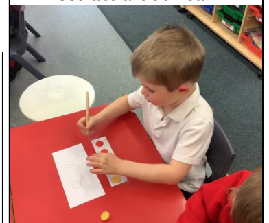
Part whole models