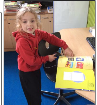
Changing library books