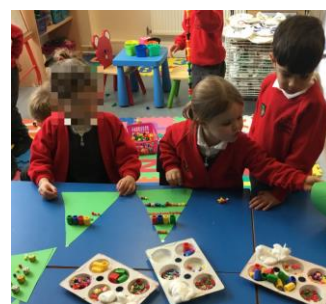
Reception Christmas trees