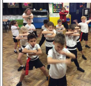
Year 2 Haka