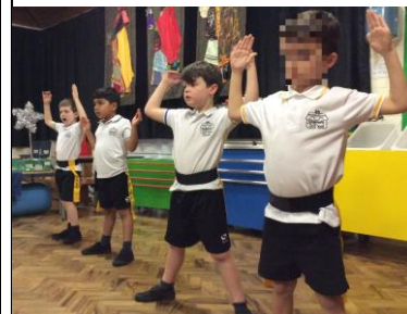
Year 1 Haka