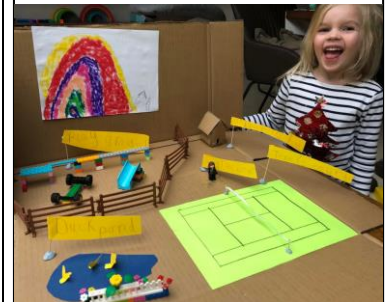
My dream park