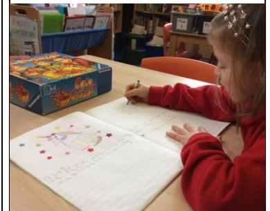
Board game review