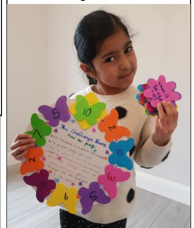
Board game design