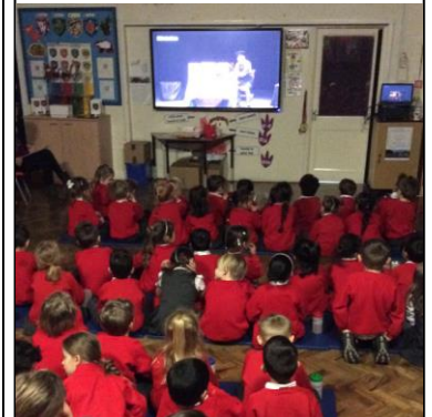
Norden Farm 'Live'