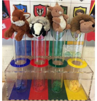
Hedgehogs in the lead, closely followed by the squirrels.