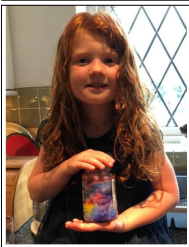
Space in a Jar