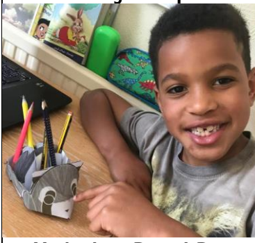
Hedgehog Pencil Pot