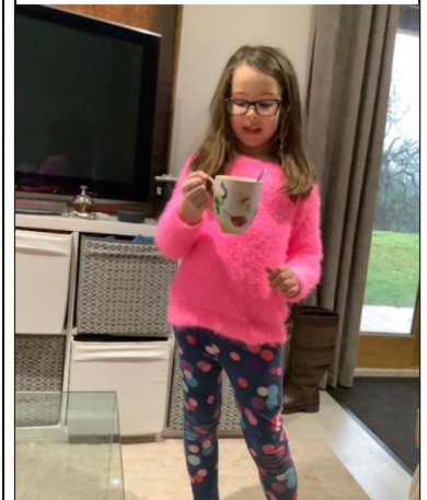
Cup of tea for mum