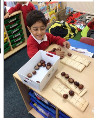
Maths with conkers!