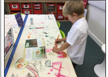
Artwork in Year 1