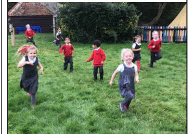
Mile a Day