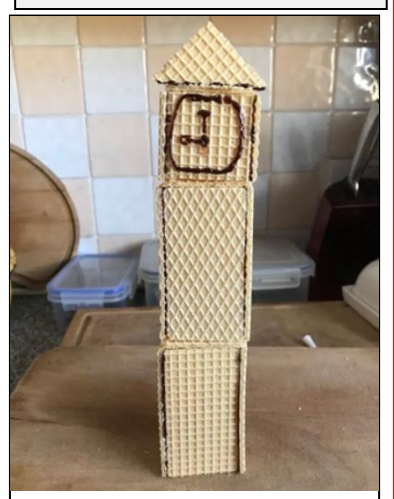
Edible Big Ben by Sophia