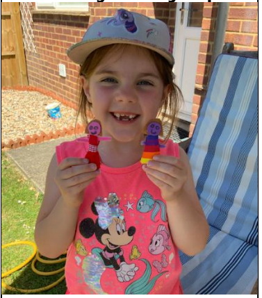
Year 2 Worry Dolls