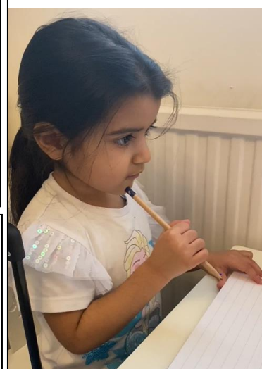
Phonics and handwriting