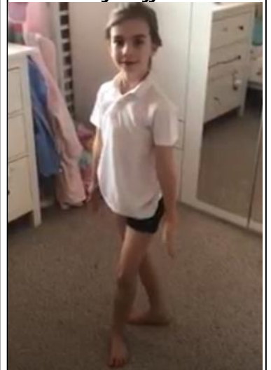
Dancing to Welsh music