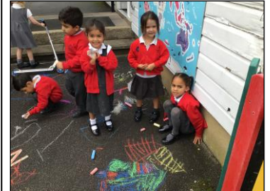
Mark making on the playground