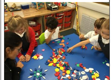
Making creations in RE