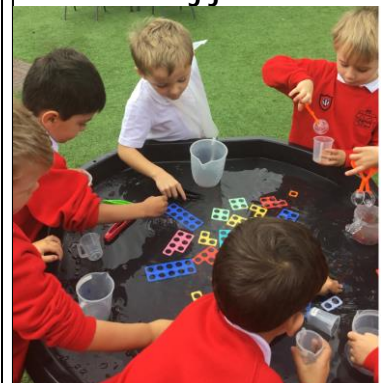
Maths water tray