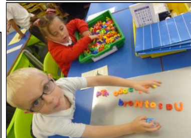
Spelling dinosaur names