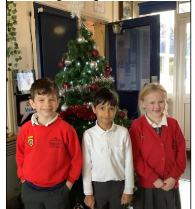
Christmas tree up!