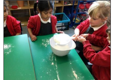
Making Gingerbread Men