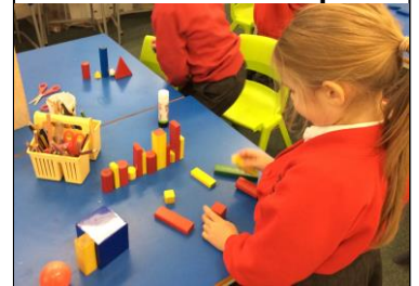
Building with 3D shapes